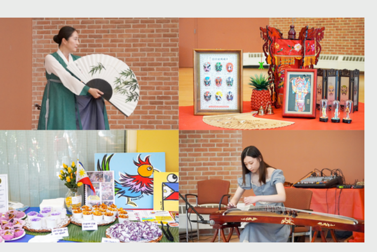
AAPI Heritage Month Celebration