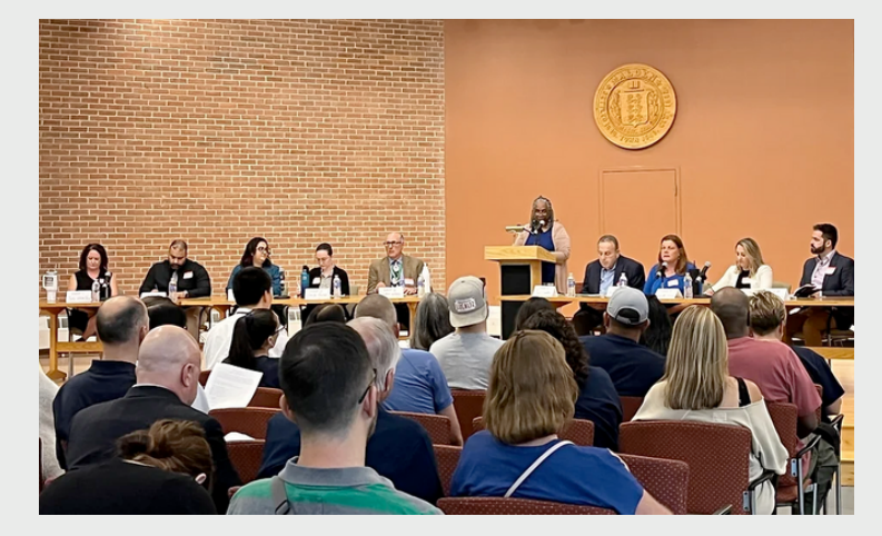
Civic Engagement Public Forums