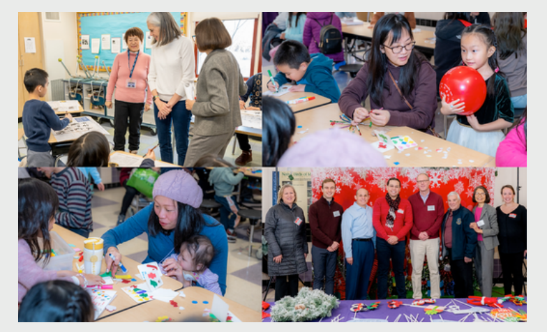
Holiday Swap Party